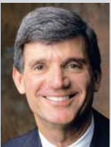
Newport Beach, California