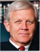
Hon. Thierry Patrick Colaw Orange County Superior Court Santa Ana, California

Judge Colaw has presided over criminal and predominantly civil trials since 1997. From 2006 to 2010 he presided over class actions, complex multi-party civil cases, toxic torts, multi-party product liability cases, construction defect cases, and California Environmental Quality Act (CEQA) cases in Department CX -104 of the Complex Civil Department of the Orange County Superior Court. He now presides in C25 of the Superior Court managing and trying unlimited civil jurisdiction cases.